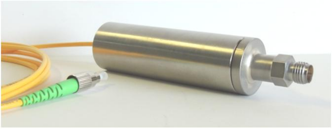
Figure 1: Fibre Pressure Sensor OEFPS-200 and 300.

Fiber pressure sensors are used to measure pressure in air, gas, water, liquid or other mediums. An optional temperature sensor can be built in with pressure sensor for monitoring both pressure and temperature at the same time. The FBG is not in physical contact with the medium in which the pressure should be measured.